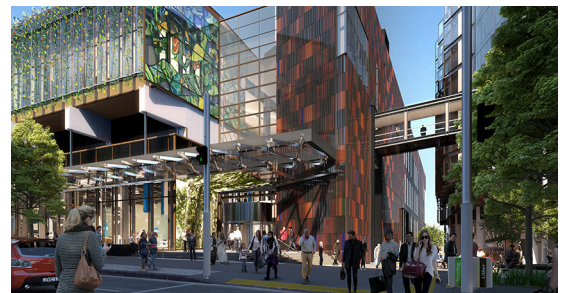
NZICC - Pest Summit 2026 venue

“The future of pest management will be shaped through collaboration — and FAOPMA is proud to help connect associations, businesses and professionals across the region.”